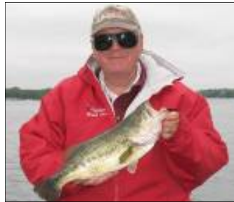
Lake Geneva 6-09-09 19½" 4 lbs. 00 oz.