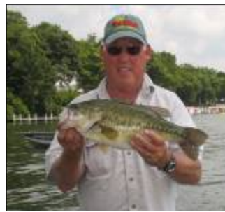
Lake Delavan 7-23-09 19" 4 lbs. 06 oz.