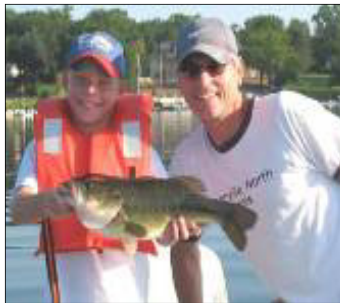
Lake Geneva 6-25-09 19½" 4 lbs. 02 oz.