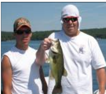
Lake Geneva 6-24-09 19" 3 lbs. 12 oz.