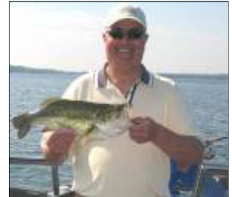
Lake Geneva 6-22-09 19½" 3 lbs. 10 oz.