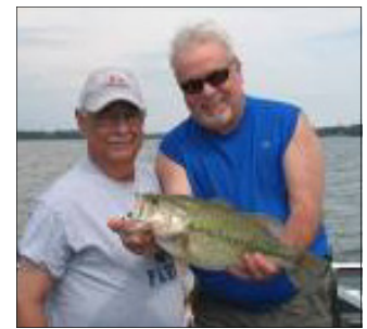
Lake Delavan 8-25-09 19" 4 lbs. 04 oz.