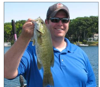
Lake Geneva June 26, 2009 16.75" 2 lbs. 0 oz.