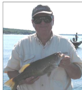
Lake Geneva June 24, 2009 18.5" 2 lbs. 12 oz.