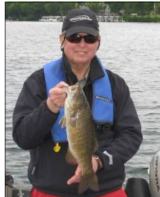
Lake Geneva June 13, 2009 18.5" 2 lbs. 14 oz.