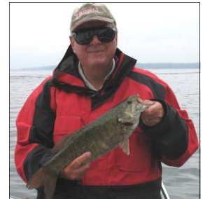
Lake Geneva June 17, 2009 19.75" 3 lbs. 0 oz.