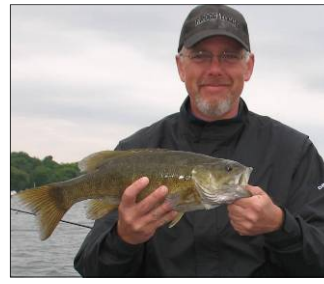
Lake Geneva June 13, 2009 19" 3 lbs. 1 oz.