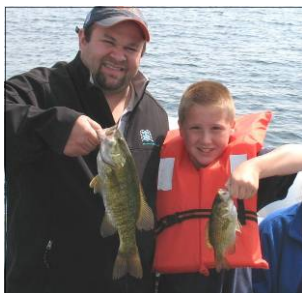
Lake Geneva June 18, 2009 16"