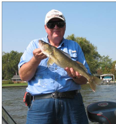
Fox Chain O' Lakes September 26, 2008 - 22"