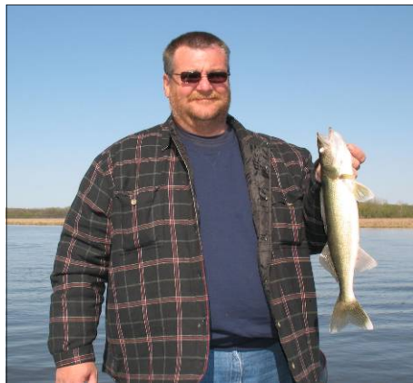
Fox Chain O' Lakes May 4, 2008 - 18 1/2"