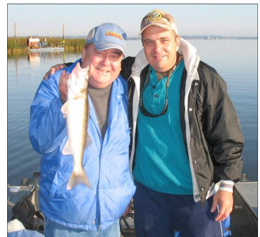
Fox Chain O' Lakes October 4, 2008 - 19"