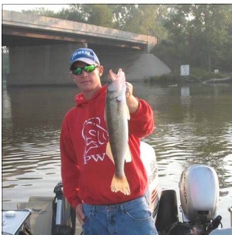
Fox Chain O' Lakes September 22, 2008 - 20 3/4"