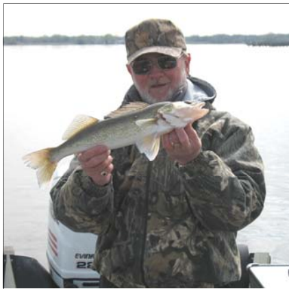
Fox Chain O' Lakes April 29, 2008 - 19"