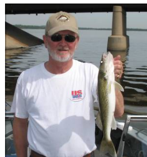
May 20 th | 19"