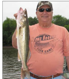
June 15 th | 23"