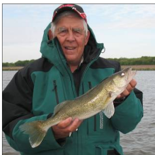
May 18 th | 20½"

Walleyes are plentiful on the Fox Chain and they are protected with a slot limit. The minimum keeper size is 14" long. You may keep three fish in the 14-18" range. The protected slot is 18-24". All fish of that size must be immediately released. Most of those fish are the females of prime spawning age and are the future of walleye fishing on the Fox Chain O' Lakes. You may also keep one walleye over 24" long. Most of our customers release their fish, and all the slot fish shown below were released right after we took the photo.