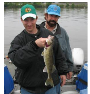
May 22 nd | 18½"