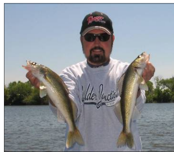
May 19 th | 16-17"