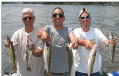
May 24 th | 15-17"