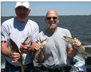
June 1 | 14"-16"