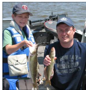
May 22 | 14" - 17½"