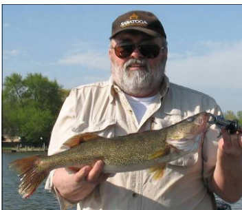
May 13 | 22½" | 4 lbs.

Pictured below are some of the walleyes caught by our clients during the spring walleye run on the Fox Chain O Lakes. Historically, our best success for walleyes on the Fox Chain is in the April - June time frame. High water and good current flow also enhances the chance of catching some nice walleyes like these.