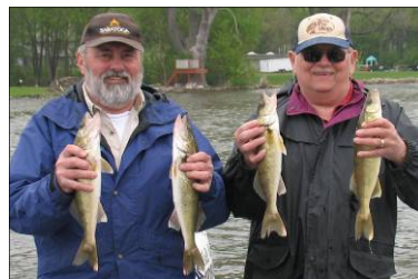
May 13 | 15"-17"