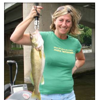
July 1 | 22" | 3 lbs. 8 oz.