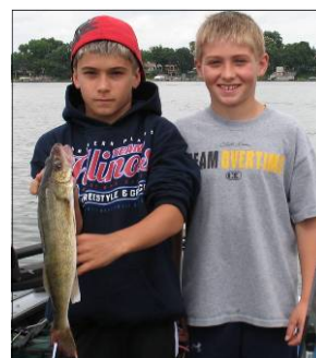
June 24 | 17"