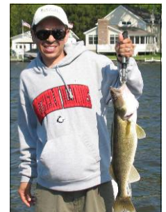
May 30 | 25¾" | 5 lbs. 12 oz.